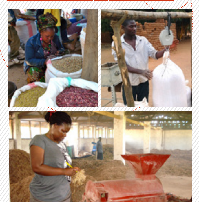
TruTrade is a for-profit company with equity positions

TruTrade puts more money into the hands of farmers. We enable investment in agricultural enterprise development to create a prosperous rural Africa.